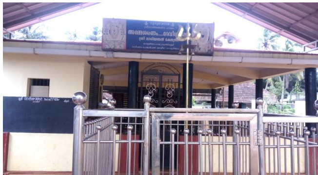
Mariyamman Temple, Paruthipully, Palghat