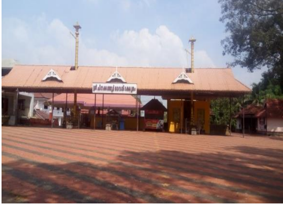
Chinakkathur Temple (Palghat)