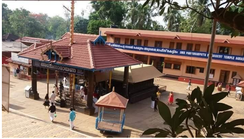
Sree Pariyanampatta Bhagavathi Temple, Mangalamkunnu, Palghat