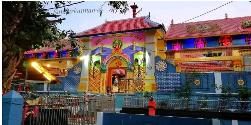
Pallasena Temple (Palghat)