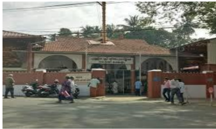
Puthur Sri Thirupuraikkal Bhagavathy Temple, Palghat