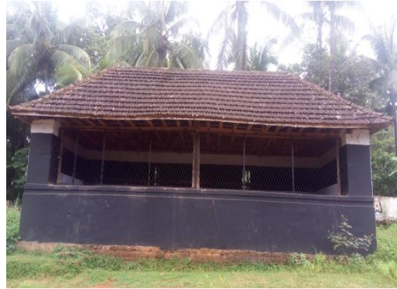
Koothumadam, Aryankavu Temple